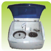
NOVA 2020 Plus Automatic Bio-Chemistry Analyzer