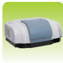
Kidney Stone Analyzer