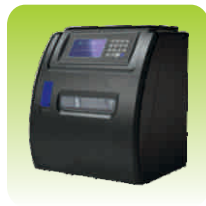
Blood Gas Analyzer