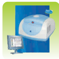
PCR/Gradient PCR/RT PCR