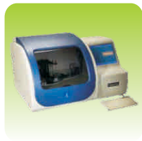
Random access analyzer for immunoassay, proteins & clinical chemistry