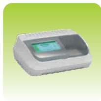
Micro Plate Reader / Washer