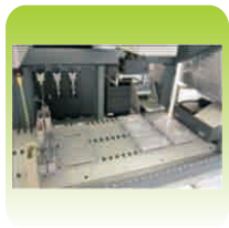
Revolutionary automation in neonatal screening