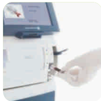
Portable POC Blood gas Analyzer