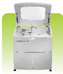
NOVA 2300 Automated Bio-Chemistry Analyzer