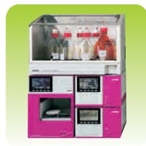
Amino Acid Analyzer