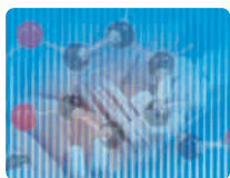
Rapid Diagnostic kits