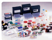
Bio Chemistry Reagents