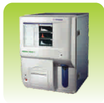
HEMA 2062 Plus Fully-automatic Hematology Analyzer