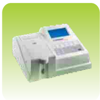
NOVA Basic Semi - Auto Chemistry Analyzer