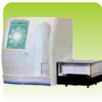
5 part Hematology Analyzer